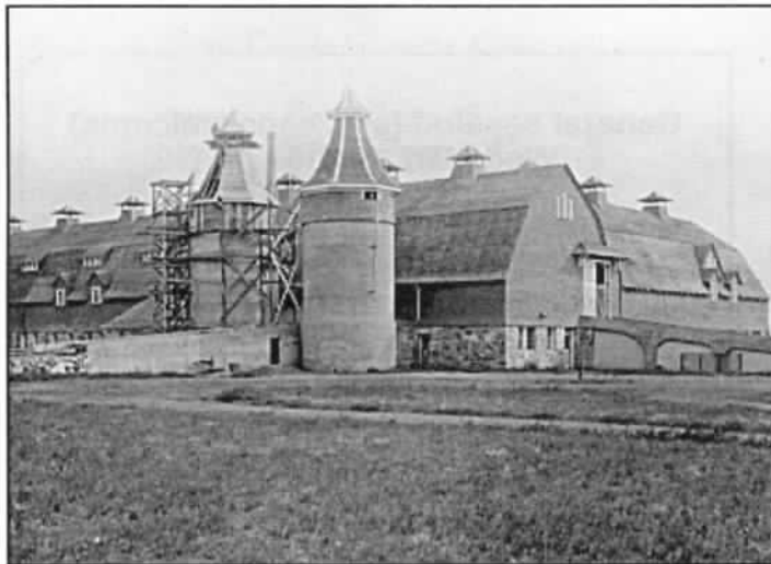
The University barn, a landmark since it was built early in the century, still stands proudly, but it is of limited value to the University farm or research programs.

If there is enough interest, a game between agro student girls and ag grad girls can be organized for Saturday. Interested players should contact Bill.